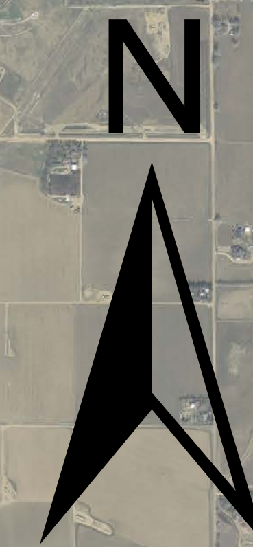
Button Rock Preserve