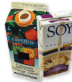
Paper Milk/Juice Cartons no foil pouches, do not flatten