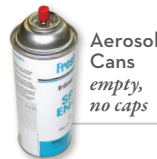
Aerosol Cans empty, no caps