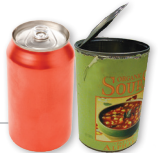
Aluminum/Metal Cans do not flatten