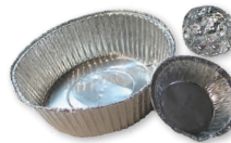
Clean, Balled Aluminum Foil 2" or Larger & Pie Pans