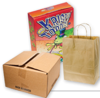
Cardboard Boxes & Paper Bags flatten boxes