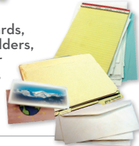
Greeting Cards, Mail, File Folders, Office Paper & Blueprints no neon or construction paper