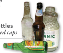
Glass Bottles no attached caps