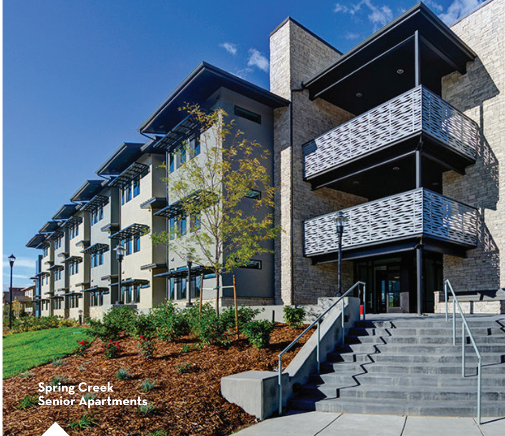
Spring Creek Senior Apartments

Be part of the solution bit.ly/take-one-step