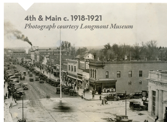
4th & Main c. 1918-1921