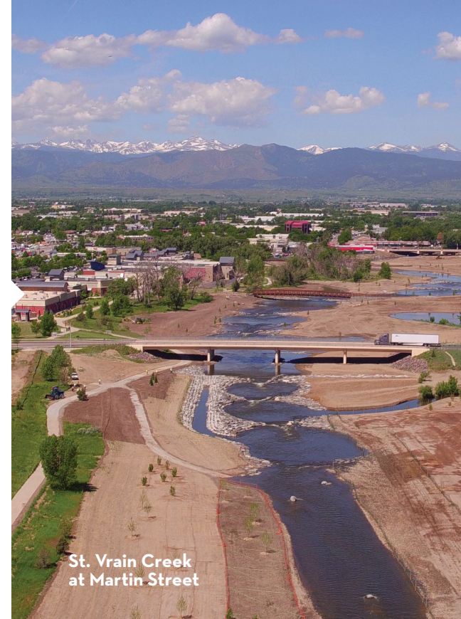
St. Vrain Creek at Martin Street