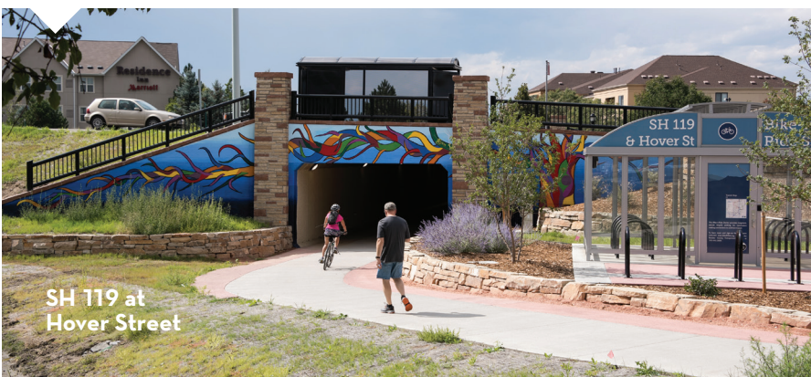
SH 119 at Hover Street