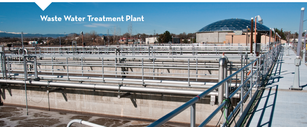
Waste Water Treatment Plant

800 metric tons of CO 2 eliminated, reducing greenhouse gases