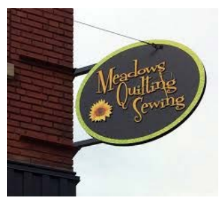
Wall, projecting, canopy or freestanding signs using individual pan channel lettering – 30 percent increase in sign area and placement of one sign per sign wall above first story.