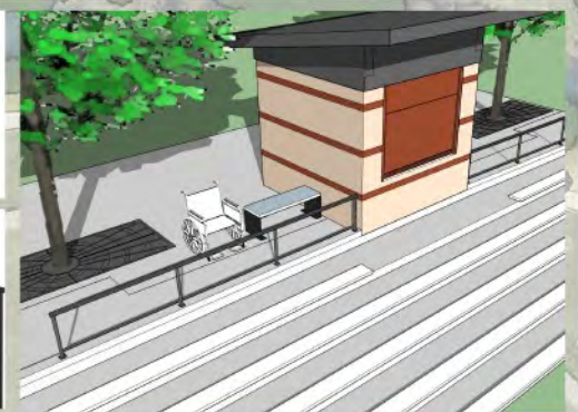
CODE COMPLIANT BLEACHER SEATING