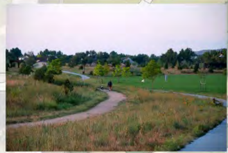
NATIVE SEED MEADOW