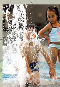
SPRAY PARK & PLAY FEATURES