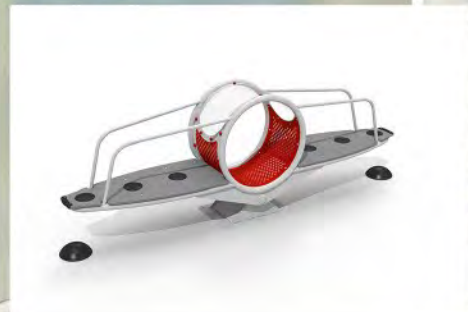
NEW PLAY EQUIPMENT