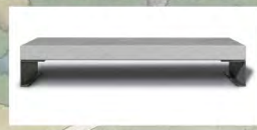
BENCHES & PEDESTRIAN & PARKING LOT LIGHTING