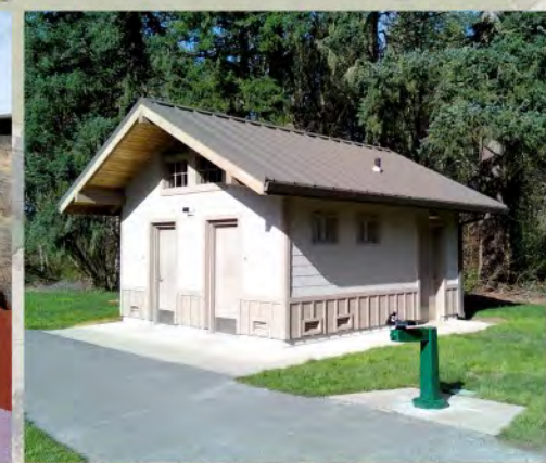
RESTROOM/PUMP HOUSE BUILDING