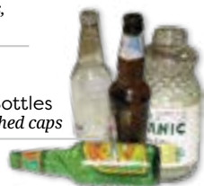
Glass Bottles no attached caps