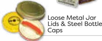
Loose Metal Jar Lids & Steel Bottle Caps