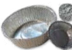
Clean, Balled Aluminum Foil 2" or Larger & Pie Pans