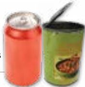
Aluminum/Metal Cans do not flatten