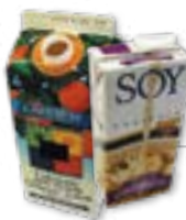
Paper Milk/Juice Cartons no foil pouches, do not flatten