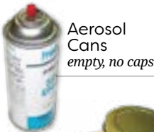
Aerosol Cans empty, no caps